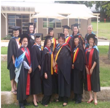
2010 AREP Ed Graduation

The Badanami Centre for Indigenous Education at UWS is committed to providing Indigenous people with access to higher education and to encourage students, staff and community members to utilise academic and cultural support facilities.