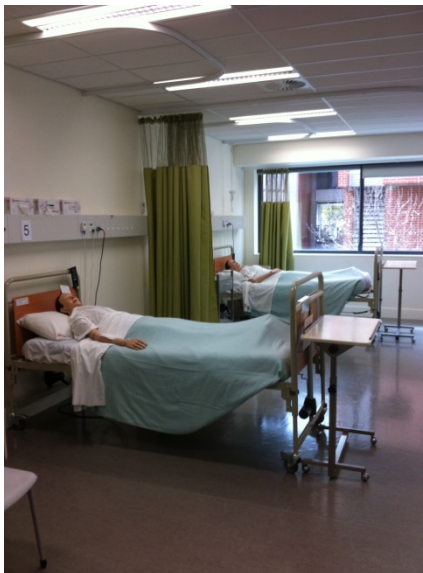
Nursing Teaching Lab Parramatta Campus

UWS offers you the flexibility to combine studies that put you in the best position to specialise in particular areas, or to keep your options more open.