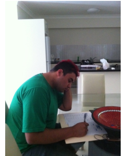
BCSD Students in accommodation