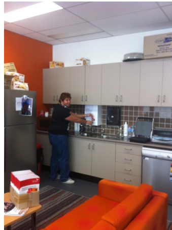
Badanami Student Centre Penrith